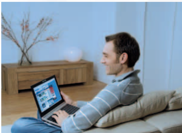
Softwareload offers legal downloads.

At the end of 2006, Deutsche Telekom AG launched Softwareload – an Internet portal for the downloading of software. With this portal the Telekom Group took a leadership role in the field of digital content.