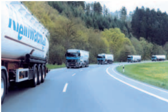
Kleinwächter fleet: Mobile business processes allow efficient resource utilisation.